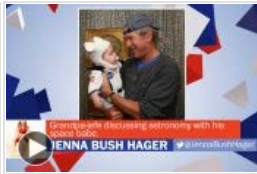
Political grandchildren do adorable things