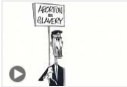
Cuccinelli equates abortion to slavery